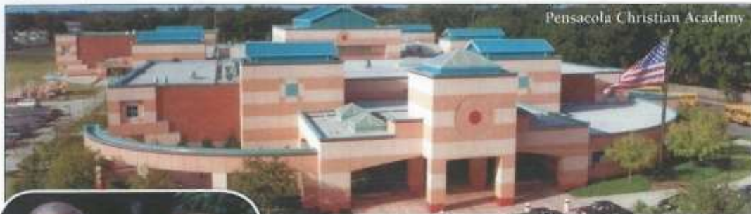
Pensacola Christian Academy

as a result of 50 years of actual classroom experience in Pensacola Christian Academy , one of America's largest and most respected Christian day schools.